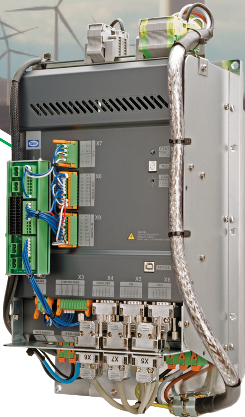
IMD 100 w. option internal 24V and wire harness